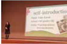
TED-Ed Student Talks