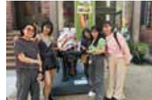
Innovators Forum in Boston