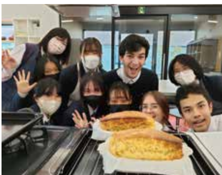
Welcoming short-term international students

In the Osaka International High School International Baccalaureate Course, the environment is such that teachers can closely monitor each student. We respect each student's individuality, develop students with a strong international mindset, and are able to take proactive action.