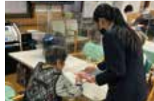
Volunteer activities at elderly care facilities

In the IBDP, activities outside of the classroom are an important part of learning. Through enriching extracurricular activities, students gain experience in contributing to society and develop interpersonal skills, enabling them to grow into world-class individuals.