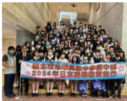
Exchange with Yuhua Senior High School in Taipei, Taiwan